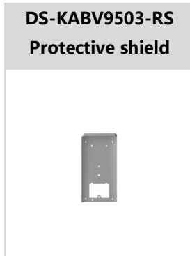
DS-KABV9503-RS Protective shield